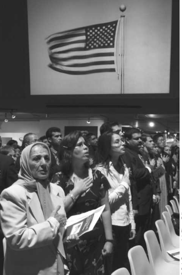
Globalization has caused population shifts as people immigrate seeking new opportunities and escaping oppressive conditions.