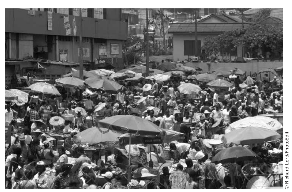
Overpopulation presents immense challenges to people throughout the world.

society. However, today, most readers of this text will have grown up in an era when the activities associated with "multicultural," "cross-cultural," "intercultural," "cultural diversity," "ethnic pluralism," and others were common. Therefore, rather than offering a set of examples to illustrate the role of intercultural communication in your social, professional, and even private lives, we now choose to argue that in the globalized world, effective intercultural communication is an increasingly essential requirement in the critical efforts to ensure world peace, improve relationships between co-cultures and the dominant cultures within each country, assure resource sustainability, and promote ecological viability.