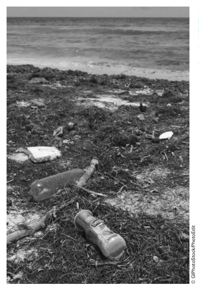
Expanding populations create pollution that crosses national borders requiring interculturally negotiated solutions.

environmental sustainability. Intercultural communication will play a role in a number of areas related to managing water shortages. International and domestic agreements will have to be negotiated regarding access to water, water distribution rights, and even water trading. <sup>16</sup> An important role for intercultural communication expertise will likely be in developing and implementing educational programs for water management and conservation, especially at the consumer level, where presentations will need to cross multiple cultural lines.